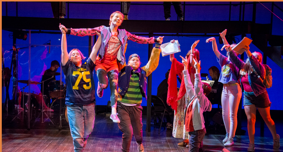
Be More Chill .

For some, it was their first true professional experience, while others have been working on shows around the Twin Cities for a couple of years. When asked what it's been like to work at